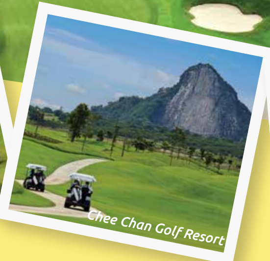
Chee Chan Golf Resort