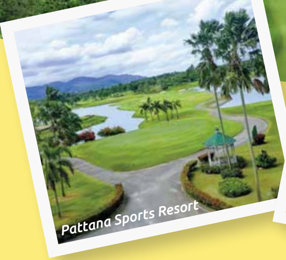
Pattana Sports Resort